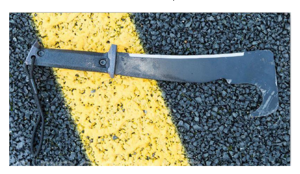
1: Photograph of the machete used by Mr Toms.