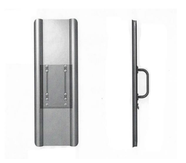
The shield was a 1200mm rectangular polycarbonate interlocking "Enforcer" shield.

22. Authorised Officer A says he retrieved the shield as "... it was agreed that the shield was an option". However, Corrections Officer D says he was not keen on using the shield as they get in the way and he personally believes it was not needed. He says Corrections officers train differently to Police and he would have preferred to just have one officer on each of Mr X's arms: