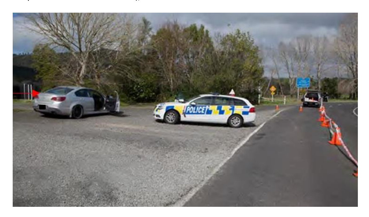
Photo taken from the Police Crime Scene Report, showing the positions of the Holden and the Police car.<sup>9</sup>